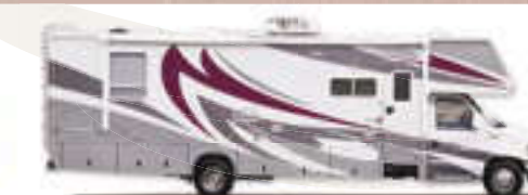
Mountain Berry premium paint package