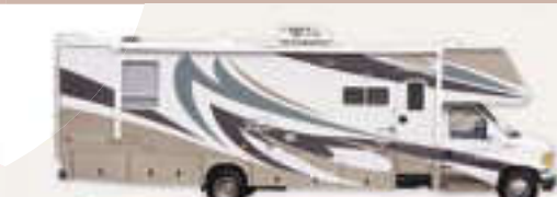
Sierra Pine premium paint package