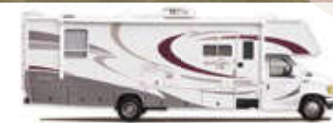
Standard graphics package