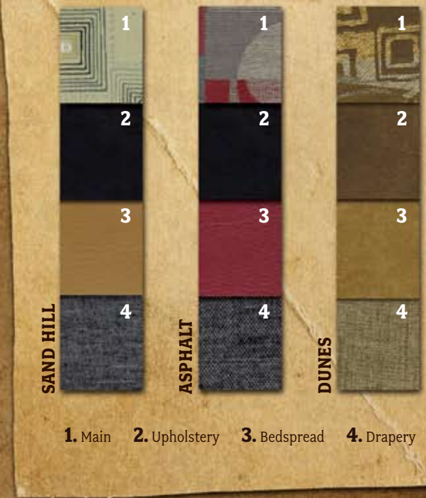
1. Main 2. Upholstery 3. Bedspread 4. Drapery

4000 watt generator Customer Value Package Customer Value Package w/ 15,000 BTU A/C Electric queen bed w/ rollover sofa (n/a T21X) Free Standing Table w/ 2 Chairs ILO Dinette (n/a T29M) Fuel station Front queen bed ILO U-dinette (T29M) Kicker® subwoofer & amplifier upgrade Patio screen room and rear awning Portable, outside gas grill w/ carrying case (n/a T29M) Retractable screen wall Roll-up cargo carpet ToyLok, retractable security cable Transition ramps (2) Super U-Dinette (T24Z & T26Y)